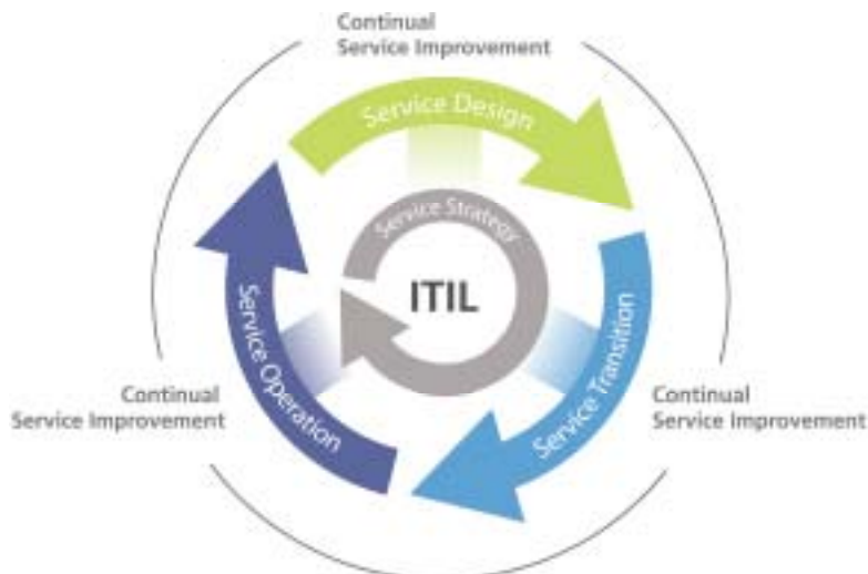
Figure 1 – The ITIL V3 Service Lifecycle

The books have been written as a set and as such have many cross references and interrelationships. Organisations are encouraged to take the full lifecycle view rather than separating the books out as this could dilute the value significantly since many of the processes are distributed across multiple books. Service Level Management is the best example of this as it is heavily referenced in 3 of the 5 books and is integrated to a lesser extent in the other 2 books.